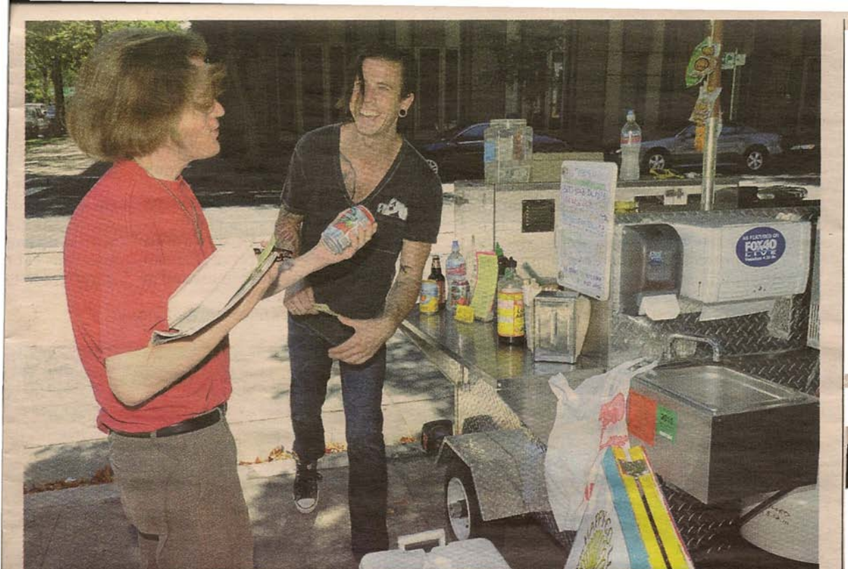
BENNIS IK&OY | SACRAMENTO BUSINESS JOURNAL